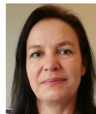
Sabine Jülicher Chair of the EU Platform on Food Losses and Food Waste

As the Commission embarks on the elaboration of a 'Farm to Fork' Strategy for sustainable food along the whole value chain, the prevention of food loss and waste will be ever-more critical. The contribution of the EU Platform on Food Losses and Food Waste lays down an important foundation for the future strategy.